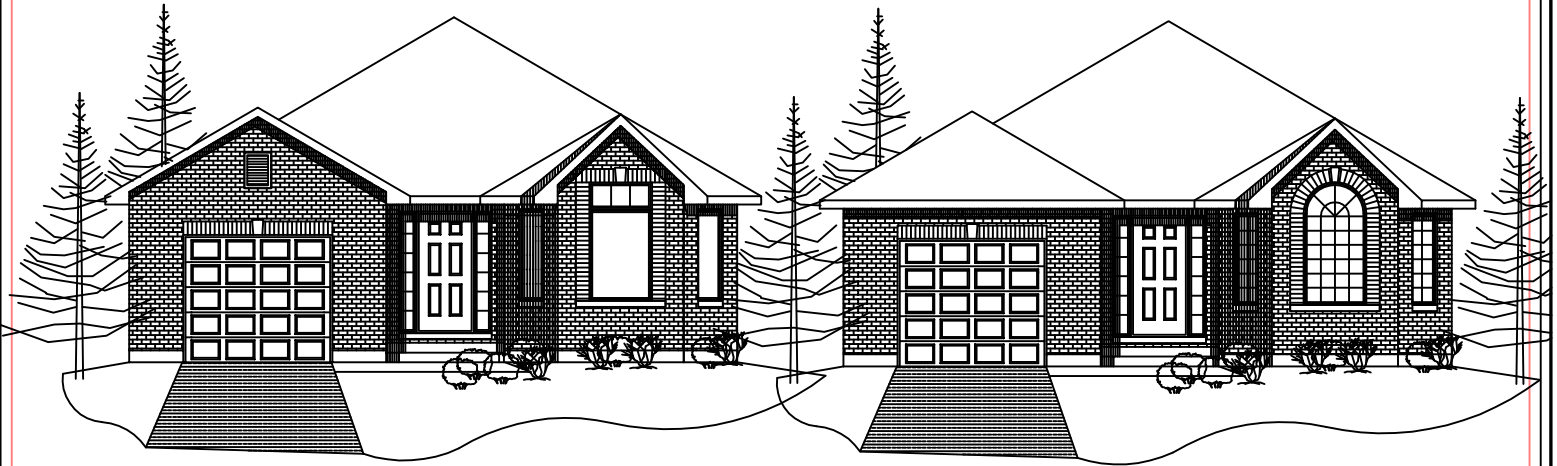
front elevation A