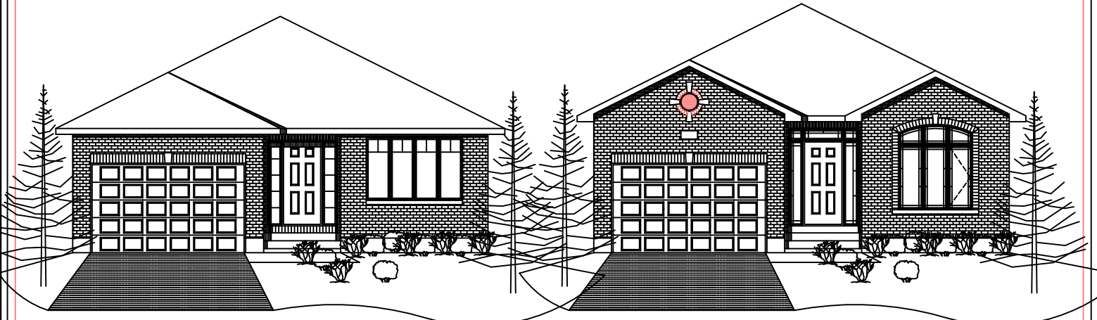
front elevation A