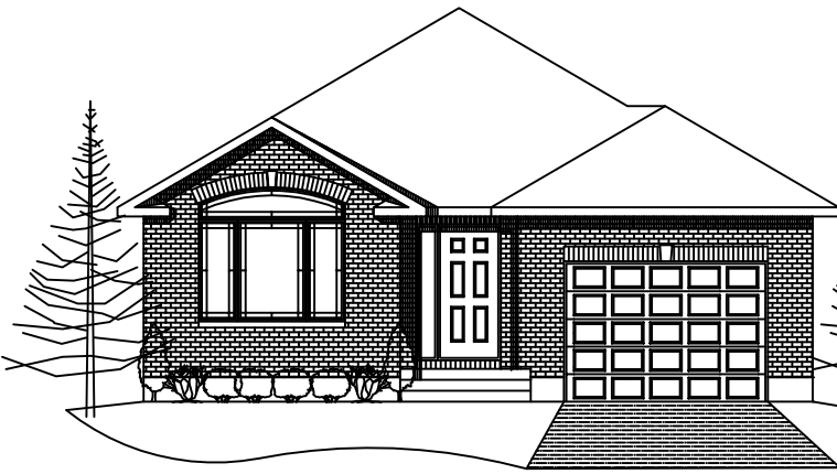
front elevation A