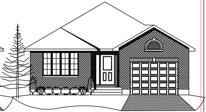
front elevation B