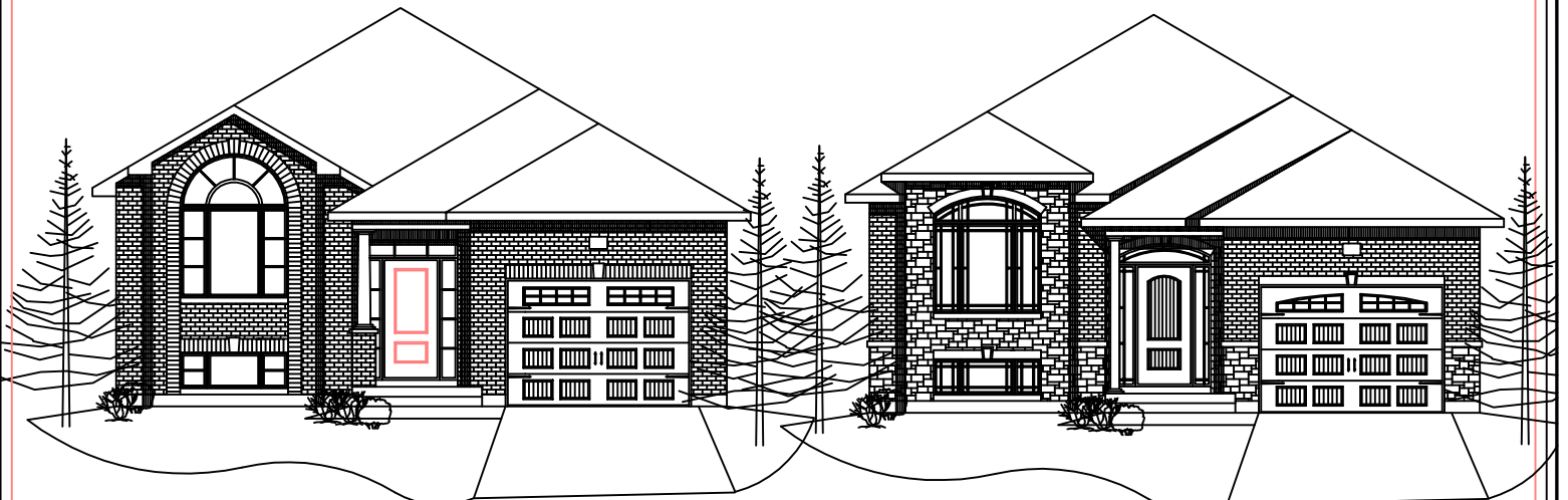
front elevation A